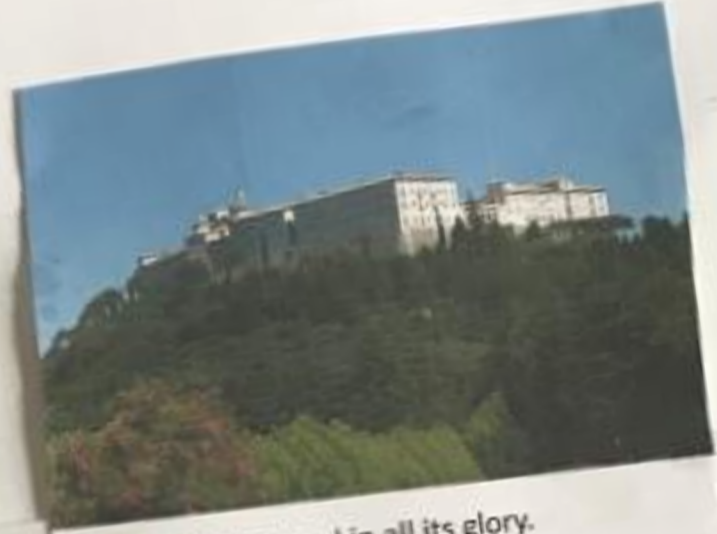
The abbey and in all its glory.