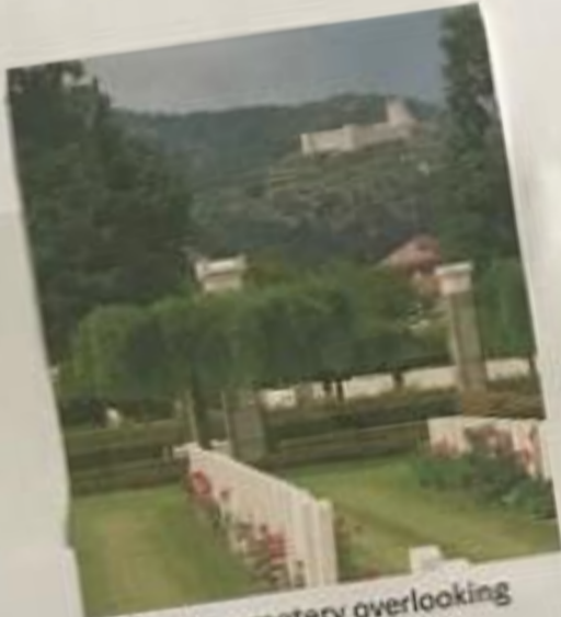
Frank's cemetery overlooking Castle hill